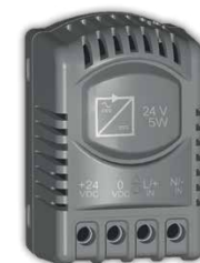
AC / DC power supply for DC fan

Optional: AC / DC power supply order no. 409005 Input 85 - 264 V AC or 100 - 300 V DC Output 24 V DC (max. 5 W)