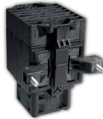
Narrow side mounting