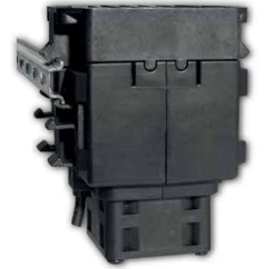
DIN rail 15mm