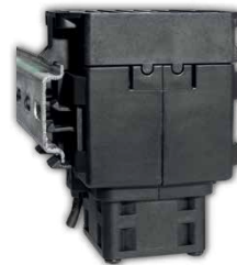
DIN rail 35mm