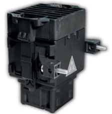
Wide side mounting