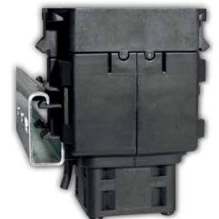
G - rail